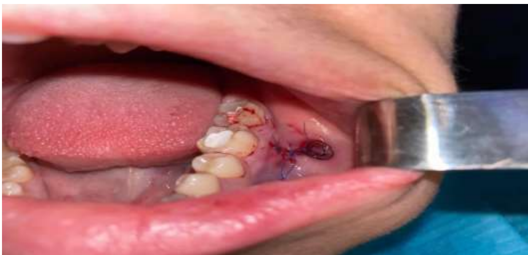
Fig. 2. After inserting the catheter and suturing.