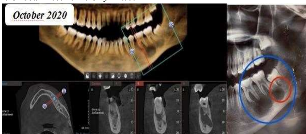
Fig.1. Computed tomography scan of the patient before treatment.

Skeletonisation of the compact lamina of the mandibular frontal region was performed. No visual bone changes (patterns, deformities) were detected. The bone cavity was opened using a ball cutter. The diameter of the trepanation hole was 0.5 cm. About 5 ml of clear, light yellow fluid was evacuated from the bone cavity under pressure. The fluid was taken for cytological examination. A catheter was placed and the bone cavity was flushed with warm physiological solution to remove cleavage products and enzymes. Hemostasis control is carried out. The wound was sutured with 6-0 polyamide thread. (Figure 3) On the following three days, the cavity was irrigated with warm saline solution. There was no discharge during the lavage procedure. The catheter was removed on the fourth day.