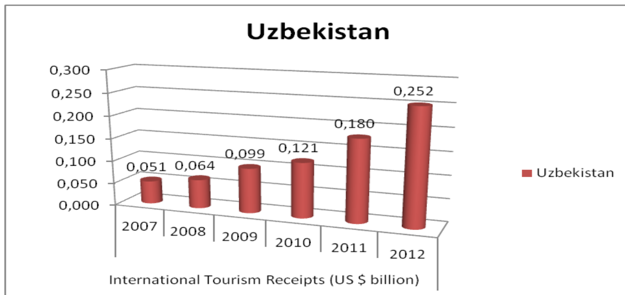
Chart 2. The cash receipts generated from international incoming tourist arrivals (in blns. USD)