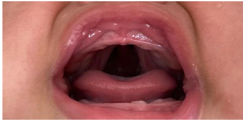
Child, 2021 Hemophilia A severe (factor VIII level - 1%), heredity is not traced. Complete cleft palate.