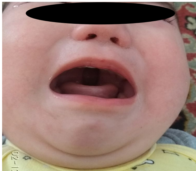
Child, 11 months (2020). von Willebrand disease, factor VIIIa level of 3%, and complete cleft palate. Heredity is favored through the maternal line. Also in the family there are 2 more children with a mild severity of the disease, without pathology of the hard palate.

Among the patients of the Republic, children with Hemophilia A and von Willebrand disease with combined pathology in the form of a cleft palate (cleft palate) were identified. 2 patients diagnosed with hemophilia A and 2 patients with von Willebrand disease. Patients with hereditary coagulopathy and color blindness were not registered in the Republic of Uzbekistan.