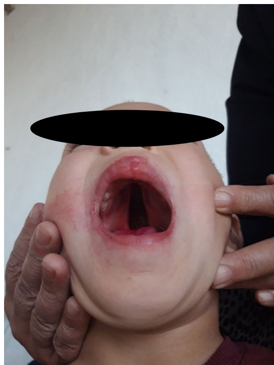
Child, born in 2016 Hemophilia A factor VIII level - 3%, and complete cleft palate.