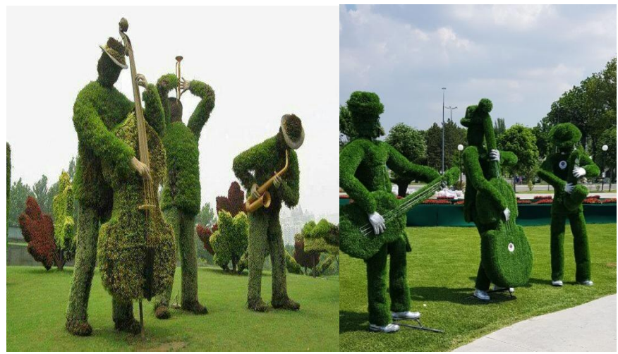
Figure 4. Artificial turf frame topiary elements

a decorative figure, high-quality artificial grass is used, imitating natural grass, with high wear resistance with the addition of UV stabilizers. Thanks to this, landscape figures are realistic, high-quality, resistant to external environmental factors, and do not fade in the sun.