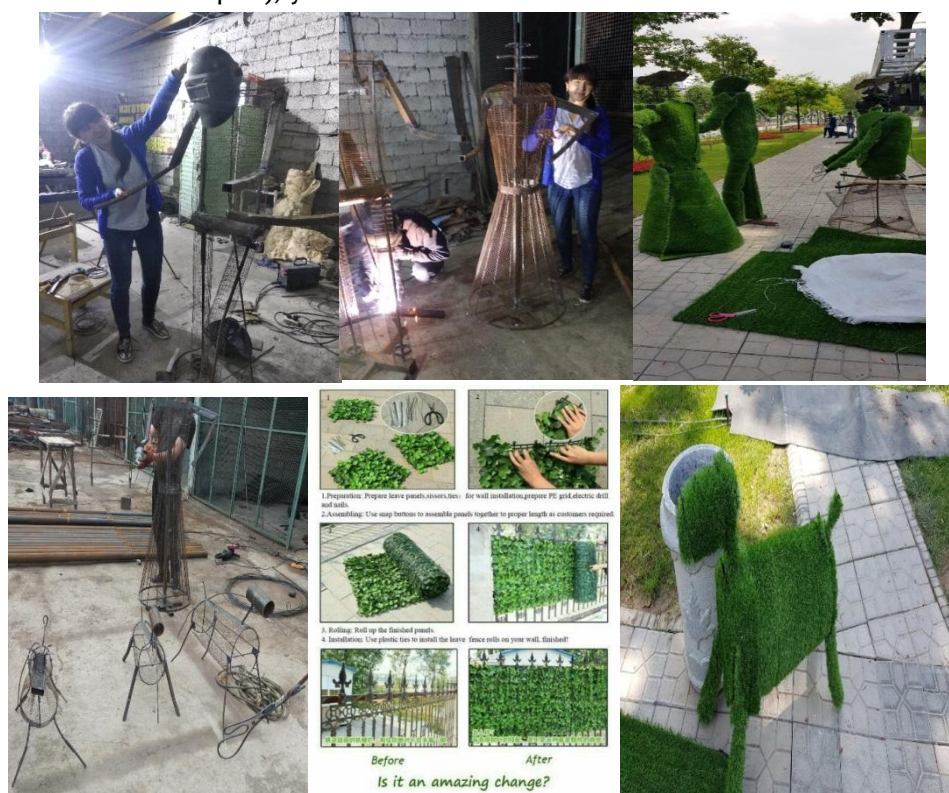
Figure 2. The process of creating wireframe topiary figures

get a green figurine that will organically complement your design in the future. It can also be a great gift for friends and family. Sometimes it is very difficult to believe that topiary is a completely feasible task. But this is not the case. If you have patience, then you can create, in the words of Wikipedia, patterned or imaginary figures for the landscape no worse than professionals.