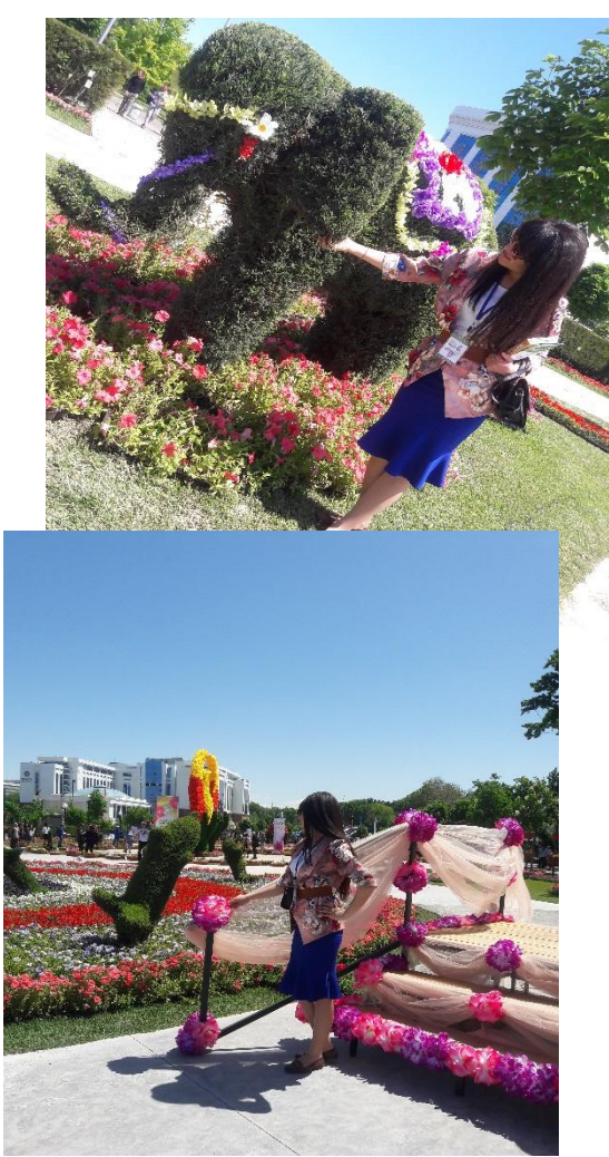
Figure 1. Examples of topiary compositions from decorative conifers