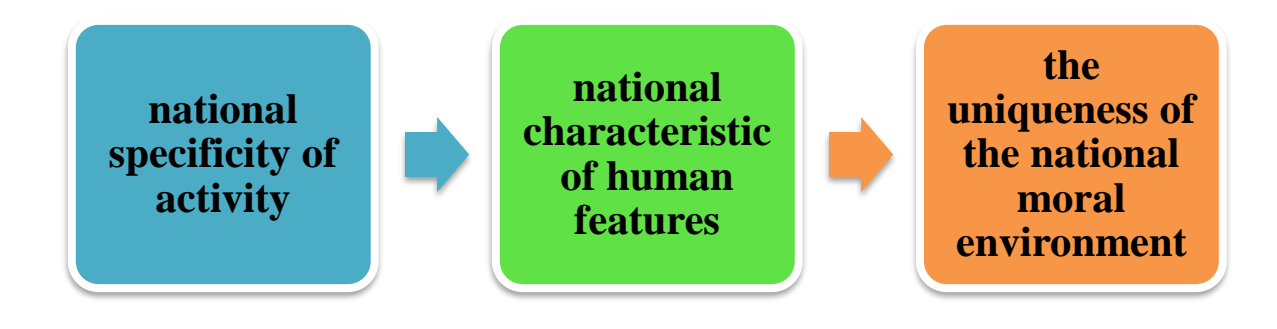
Figure 1. The influence of national characteristics on human activity [3].

National psychological characteristics of people affect their activities in the following ways: