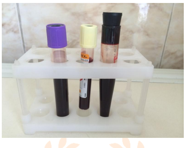
Figure 2. Blood sampling