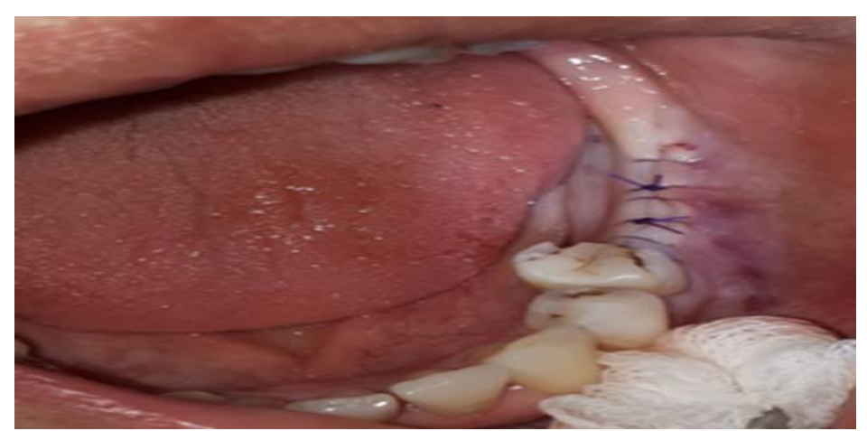
Fig.3 c-Sutures applied

Six months after the implants had become fully functional, radiographic examination showed