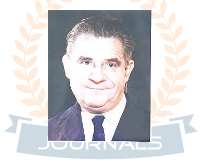
Figure-1: Mikhail Petrovich Chumakov, a Russian virologist (November 14, 1909-June 11, 1993)

a viral etiology has been suggested in 1963 by Mikhail Petrovich Chumakov (Figure-2) [3].